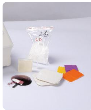
Liquid, Powder, Solid Sample Measurement

Transmittance Measurement: Adopt D/0^\circ Geometry, conform to ISO, CIE, ASTM and DIN standard.